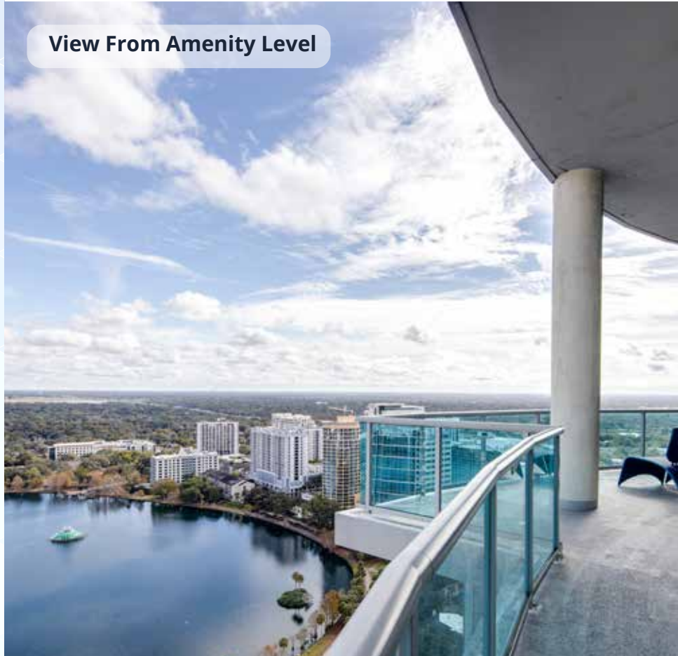
View From Amenity Level

HIGHEST deck, lounge, workout room and private entertainment area in Orlando. Free 'Lymmo' shuttle stop directly in front of building. Unobstructed view of Lake Eola and a panoramic view of Downtown Orlando. Entire Downtown Core is within walking distance.