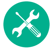
On-Site Building Engineer