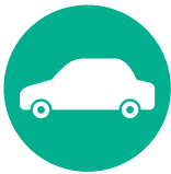
Free Covered Parking