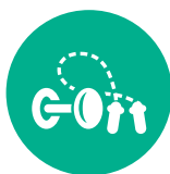
Fitness Center with new equipment, showers, and lockers